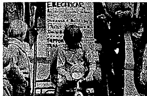
A youngster tries out the electric car built by a group of students at the University of Colorado.