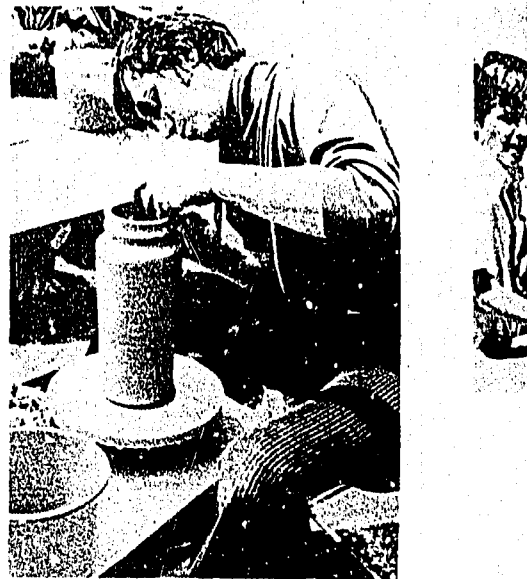
Potter demonstrates the use of the potter's wheel.

An audible sigh of relief went up from the Boulder Experimenters. Less than a month before the scheduled dates of the fair, and all their efforts since November had almost gone down the drain!