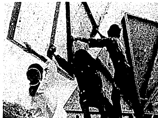
Putting a section of the 39-foot geodesic dome in place.